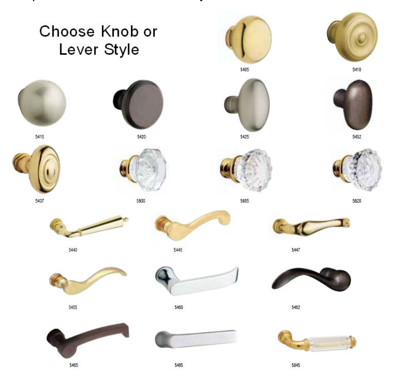
Step 1: Choose Knob or Lever Style