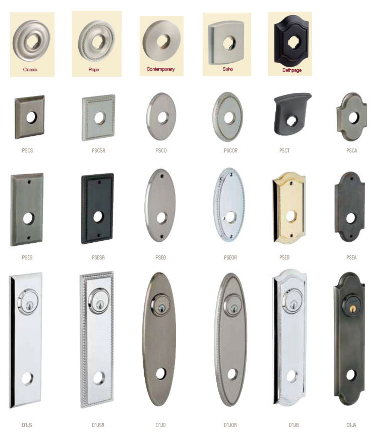
For 10" Rose, please specify with or without deadbolt.